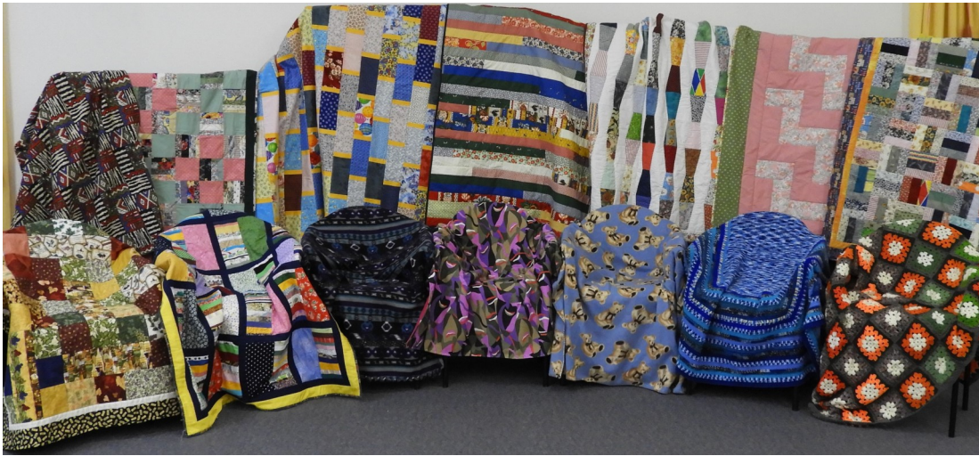
Left and below - Twenty-nine "New Beginnings" quilts going to Northern Domestic Violence Service (NDVS).

Members and Friends of our club have managed to complete 39 quilts for distribution this year and we wish to thank all those involved for their contribution to this ongoing project.