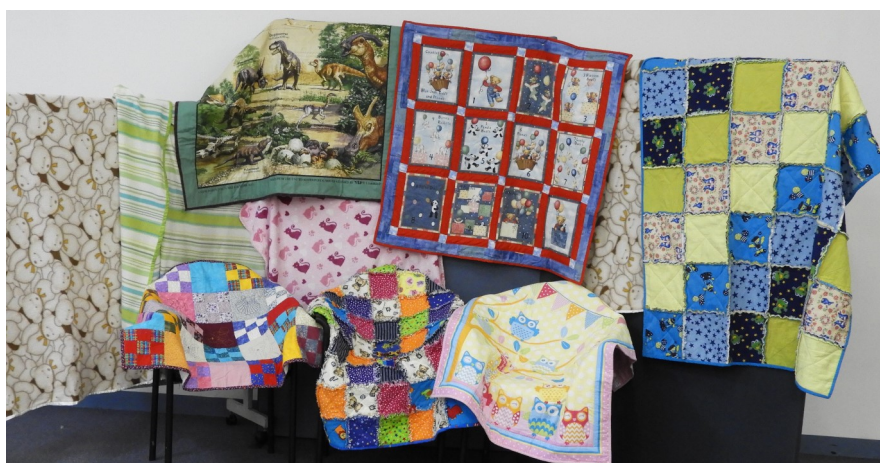
Ten "Wee Care" quilts being shared between Adelaide Women's and Children's Paediatric Emergency Dept. and NDVS.